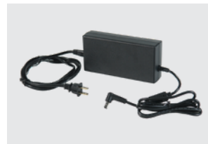
AC POWER SUPPLY (ALL CORDS INCLUDED)