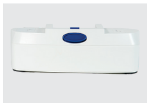
16-CELL BATTERY PACK