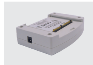
DESKTOP BATTERY PACK CHARGER (OPTIONAL)