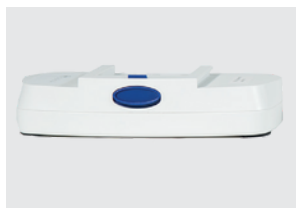
8-CELL BATTERY PACK