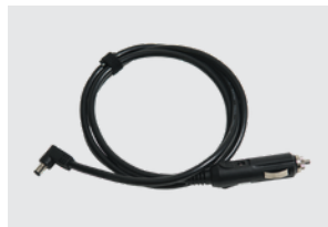
DC POWER CORD